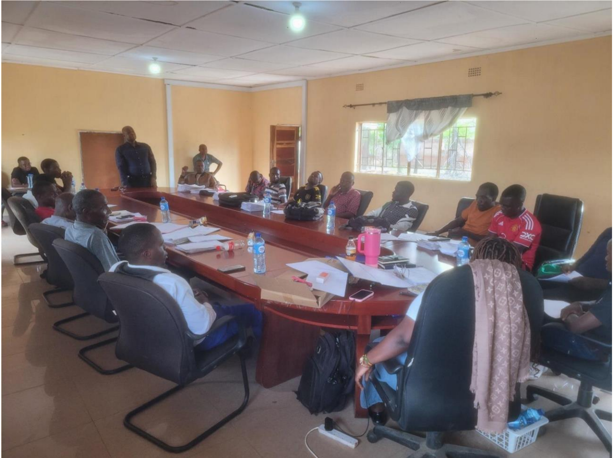
Stakeholders seated in the council chamber listening to the opening remarks.